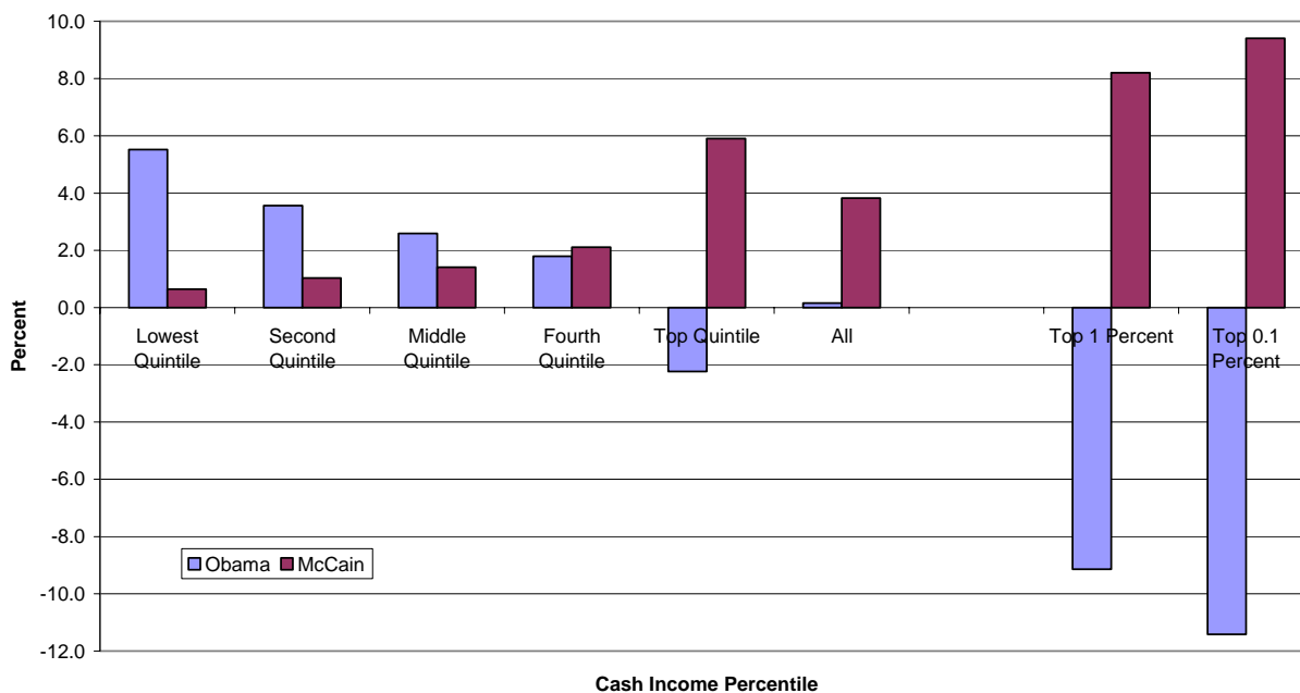
Figure 3. Obama and McCain Tax Proposals as Described in their Stump Speeches Average Percentage Change in After-Tax Income, 2009

Notes: All provisions are assumed to be fully phased in. The Obama proposal includes a payroll surtax.